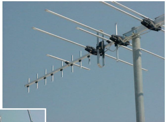
VHF Horizontally Polarised / UHF Vertically Polarised