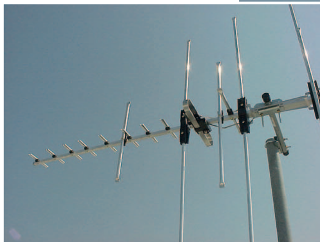
VHF Vertically Polarised / UHF Horizontally Polarised